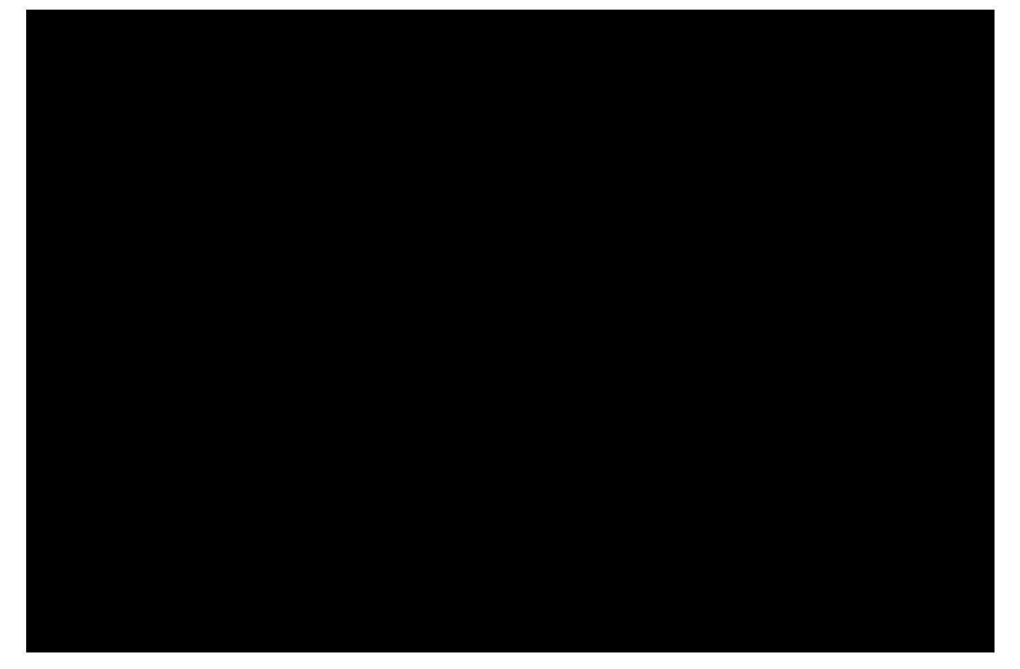
TABLE 1 (Secured Party):

The Depo Bank may accept and act upon written instructions from the Secured Party signed by two or more persons listed in Table 1 below: